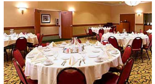
Wide choices of meeting venues

Let us close the distance gap... and work as your meeting support connector! We can arrange for bids and scheduling of equipment rental, regional speakers, shuttle service, car rentals and more.