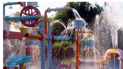
Splash Zone water park

The Convention and Visitors Bureau will provide you with personalized family entertainment options which fit your group's needs and convention timeframe.