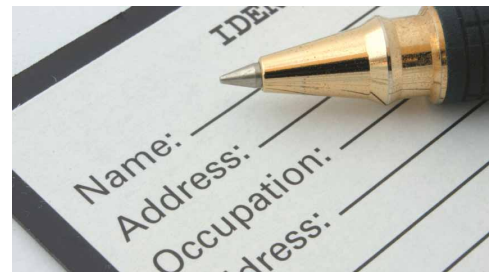
Registration services are provided